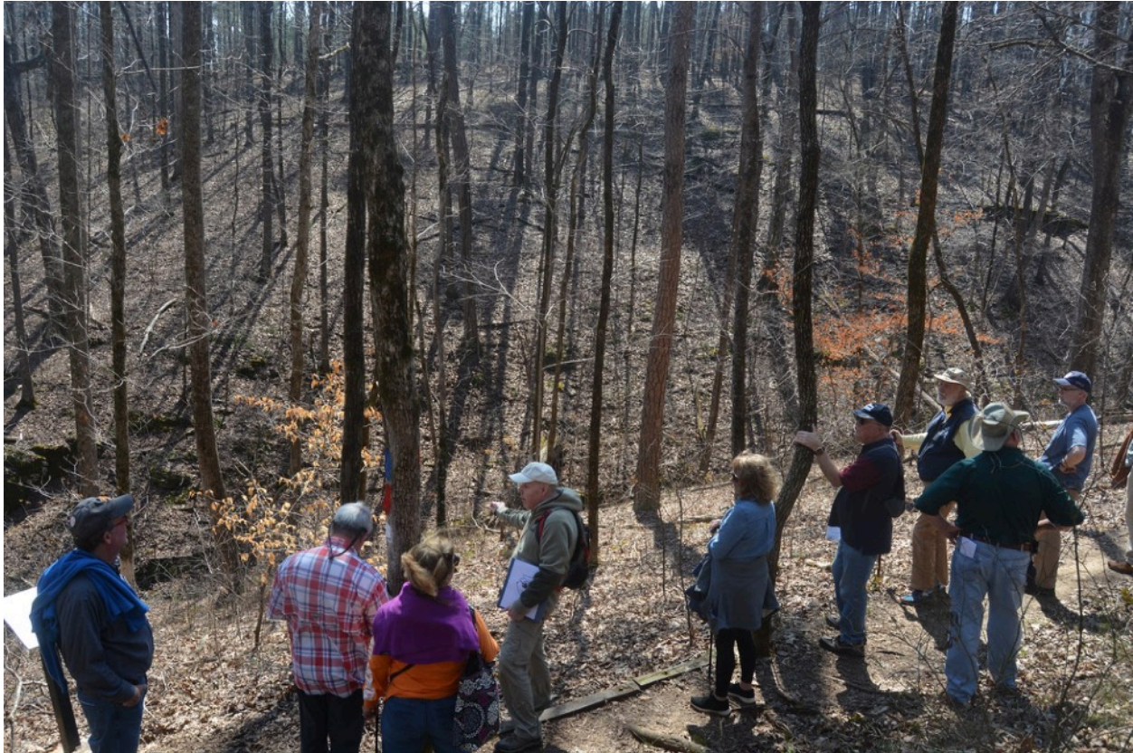
With Guide Michael Shaffer, March 6 tour participants look into the ravine at Pickett's Mill battlefield. Here Union forces sustained approximately 1,600 casualties within 30 to 45 minutes.