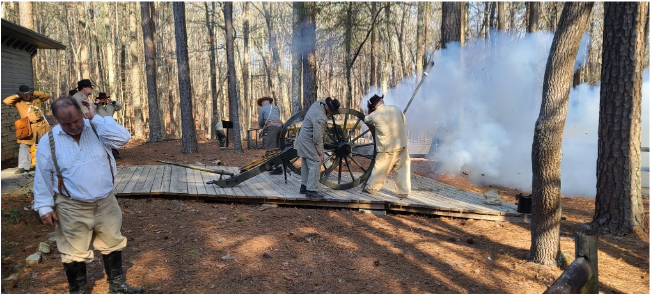
One of the cannons used during the Battle of Pickett's Mill is on display in the museum. For ACWRT's March 5 tour there was a firing demonstration. The cannon is on loan to the park from the Atlanta History Center.