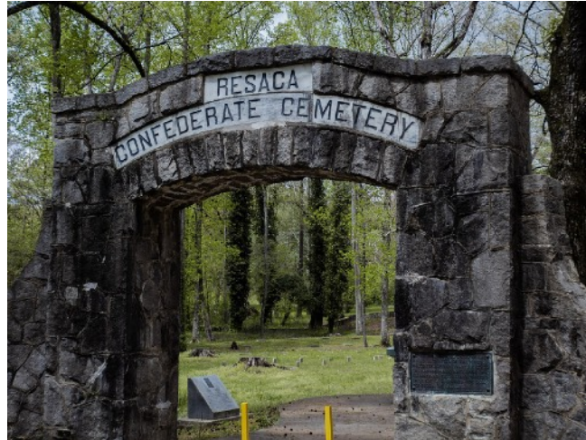
Entrance to the Resaca Confederate Cemetery.

Resaca Confederate Cemetery 9 a.m.: johnbiddy@bellsouth.net; 706-581-5366