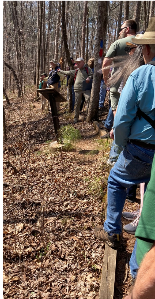
Above: At the ravine where Granbury's Texans faced the federals trapped in the ravine.