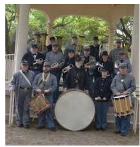
8th Georgia Infantry Band