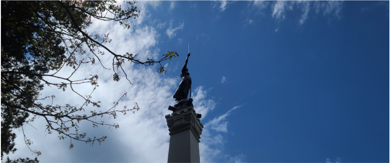
Bellona, the Roman goddess of war, watches over the battlefield near the visitor center and museum.