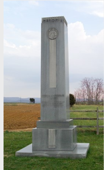
Georgia Monument at Gettysburg Dedicated in 1961 for the Civil War Centennial.