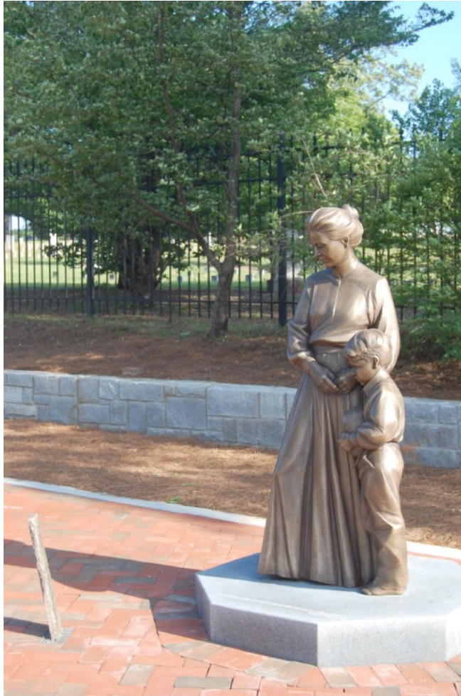
This statue of a Mother and Son was dedicated in 2012 at Brown Park in Marietta. It stands outside the Confederate Cemetery.