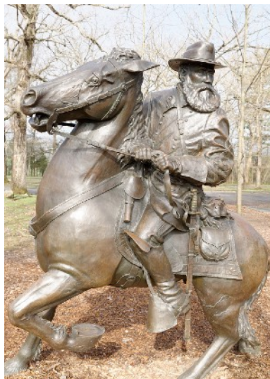
At the Pitzer Woods, Gettysburg National Military Park: Equestrian statue of General Longstreet on his horse Hero.

T uesday's program will offer a new look at the performance of Lieutenant General James Longstreet at Gettysburg. Longstreet has long been scapegoated for Confederate failures through the three-day battle. Our