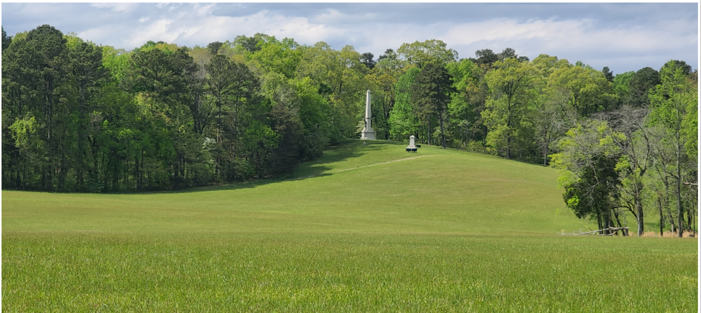
Monuments in the distance commemorate the men who fought those frigid days in September 1963.