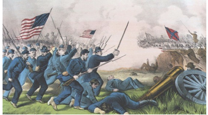
The Battle of Jonesboro: Currier and Ives