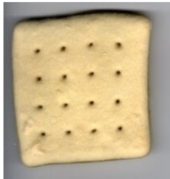
Hardtack

T he Chickamauga Battlefield Visitor Center is open from 8:30 a.m. - 5 p.m., Monday through Sunday. There are fascinating exhibits with relics from the battle, a film and a bookstore. Information for