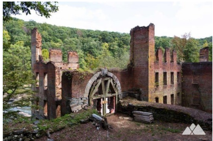
New Manchester Mill Ruins at Sweetwater Creek